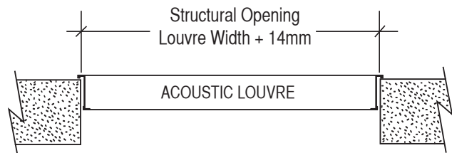
TYPICAL SECTIONAL PLAN